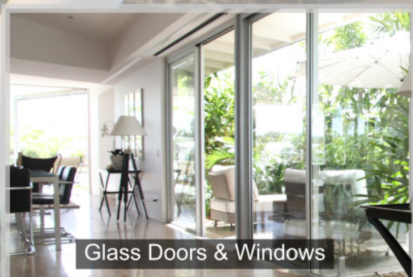
Glass Doors & Windows