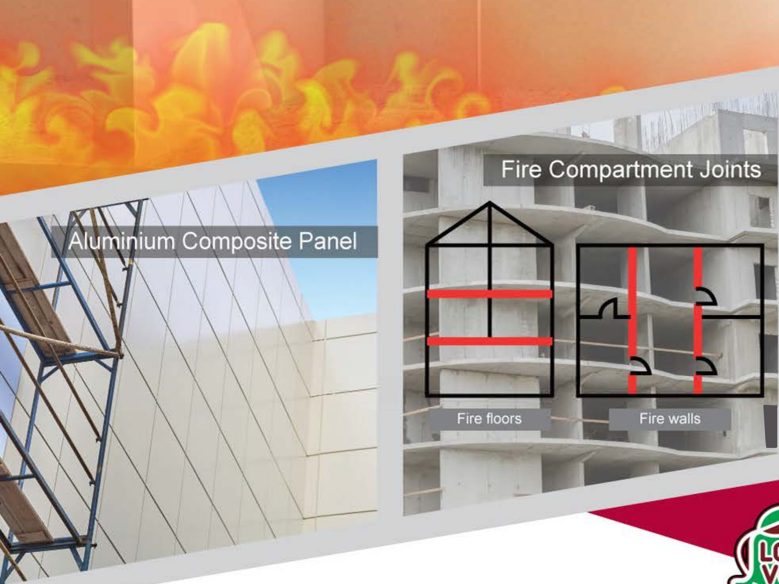
Aluminium Composite Panel