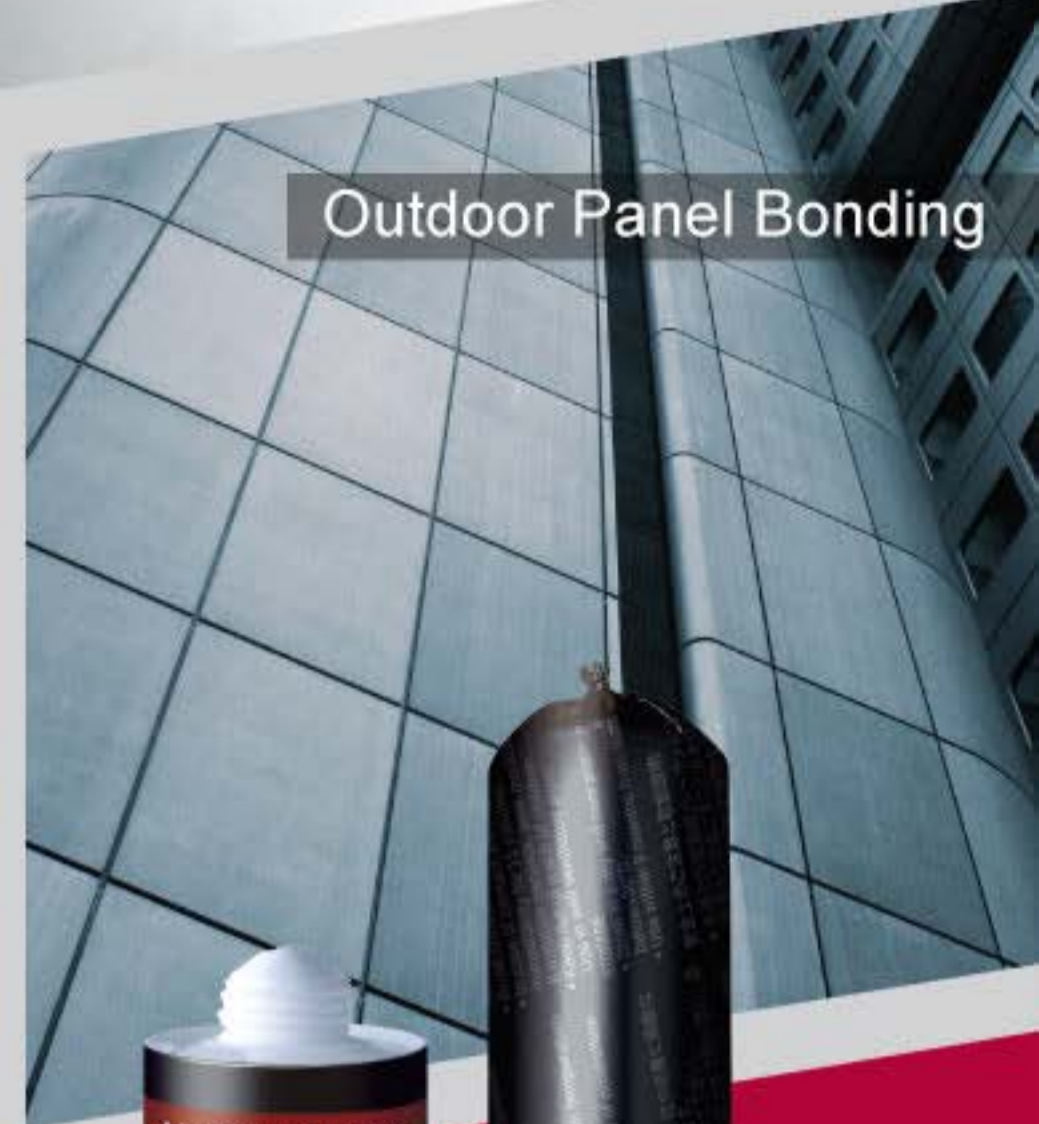
Outdoor Panel Bonding